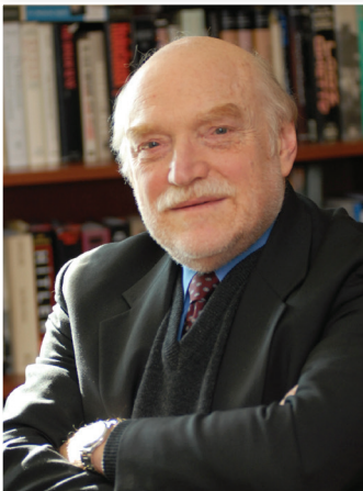
Walter Reich President's Medal Recipient